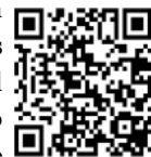
Table & Chairs Rental:

Scan this code with your phone's camera to sign up for our digital bulletin and parish notifications by entering your cell phone number and email and then joining the "Weekly Bulletin" group along with any other groups that you would like to be a part of.