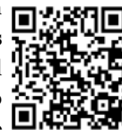
Table & Chairs Rental:

Scan this code with your phone's camera to sign up for our digital bulletin and parish notifications by entering your cell phone number and email and then joining the "Weekly Bulletin" group along with any other groups that you would like to be a part of.