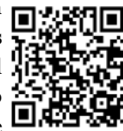
Table & Chairs Rental:

Scan this code with your phone's camera to sign up for our digital bulletin and parish notifications by entering your cell phone number and email and then joining the "Weekly Bulletin" group along with any other groups that you would like to be a part of.