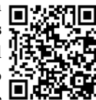
Table & Chairs Rental:

Scan this code with your phone's camera to sign up for our digital bulletin and parish notifications by entering your cell phone number and email and then joining the "Weekly Bulletin" group along with any other groups that you would like to be a part of.