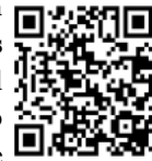
Table & Chairs Rental:

Scan this code with your phone's camera to sign up for our digital bulletin and parish notifications by entering your cell phone number and email and then joining the "Weekly Bulletin" group along with any other groups that you would like to be a part of.